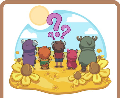
They get lost in Flowerland, a land filled with lots of flowers.