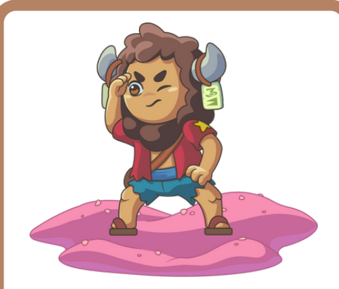
Agwa tries to find his friends as he wanders through flower valley.