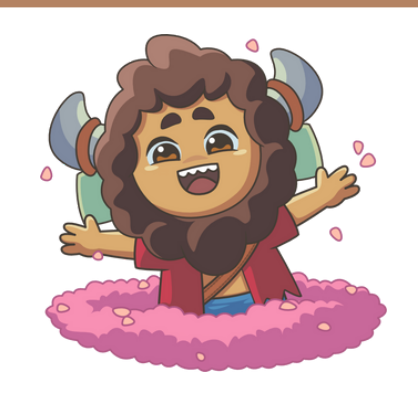
Agwa falls out of the storm and lands on a heap of soft pink and white petals.