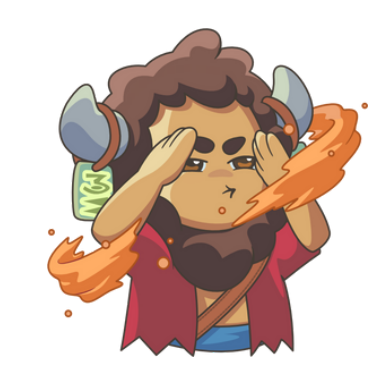
Agwa can only see the colour orange while he is in the storm.