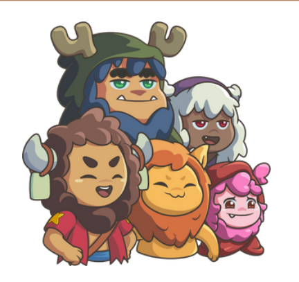
Agwa, Boosh and their friends go on a quest to see the Guardian.

Put the story in order and then complete the story with the help of the picture clues.