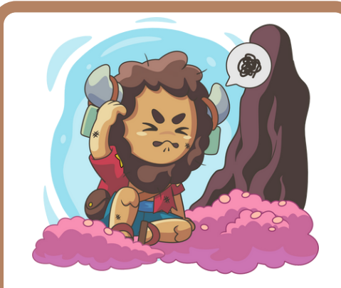
Agwa tries to climb out of the valley, but falls back down into the petals.