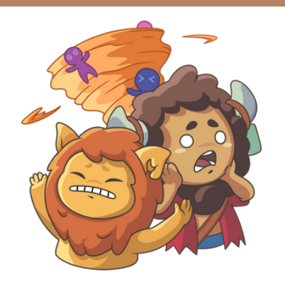
Suddenly, Agwa and Boosh and their friends get trapped in a storm of pollen.