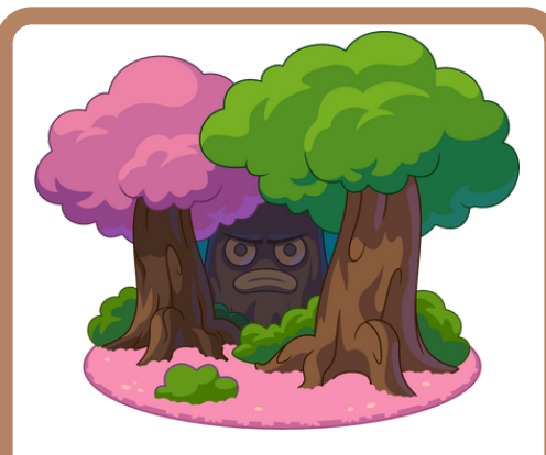
A tiny face looks angrily at Agwa before disappearing.